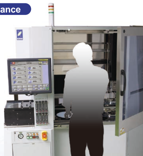
The large door and processing space increased the maintainability.